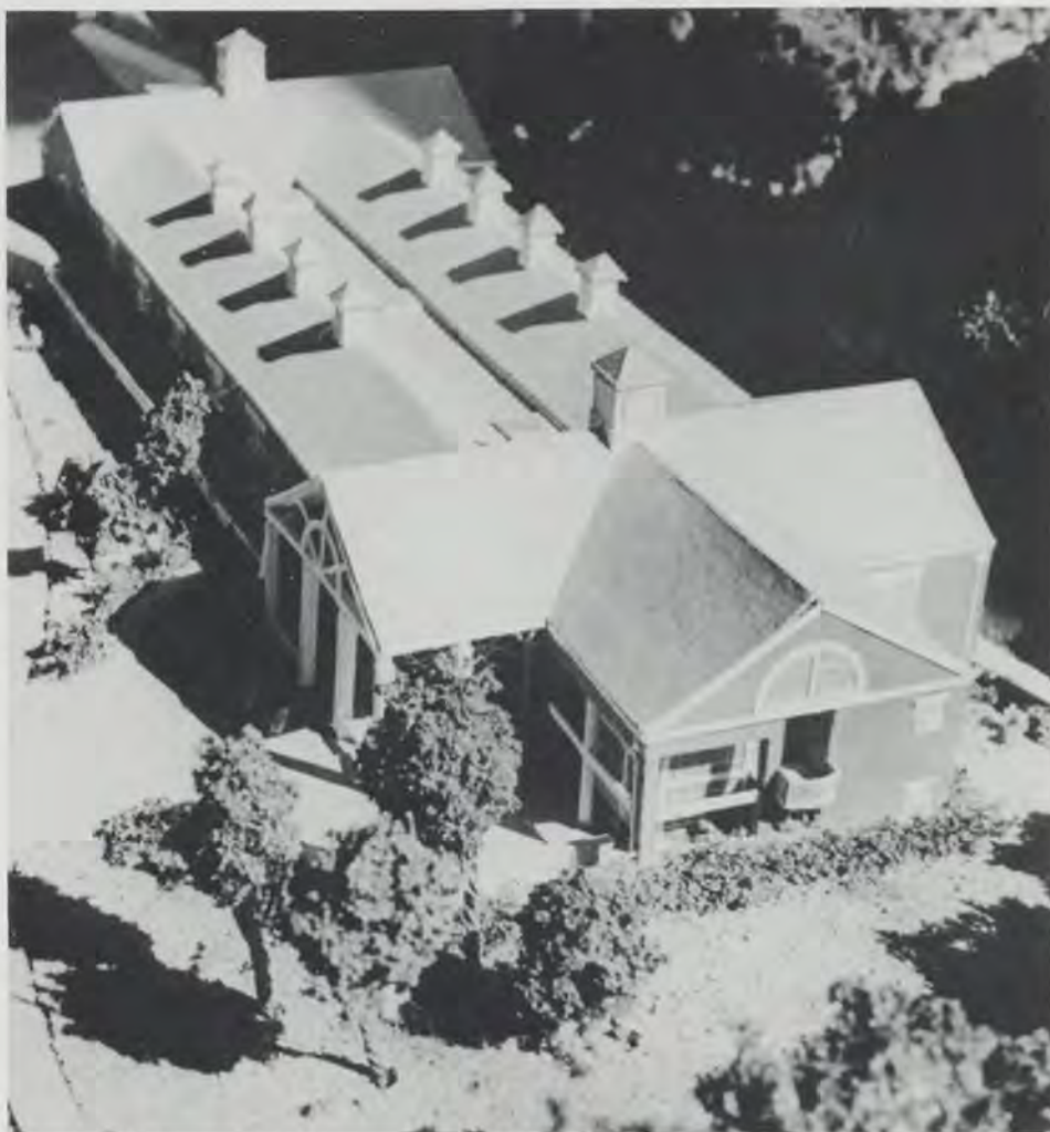
A model of the new addition as viewed from the school's main entrance.

Other features of this "smart building," as Tom Stadulis describes it, are energy efficient and "warmer" parabolic lighting, air conditioning and heating controls for each classroom, a covered outdoor play area for rainy days and lots