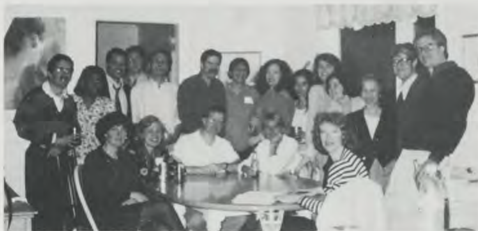
The class of '72 at their 25th reunion.

Dear Class, Well our 20th has come and gone. I enjoyed seeing all of you who attended and for those of you who were unable to make it, plan to attend the next big one as it was well worth it! For those of you who asked about getting a copy of the notes I collected I am including them here. I would