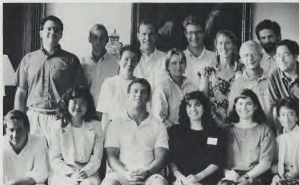
New faculty for 1992-1993.