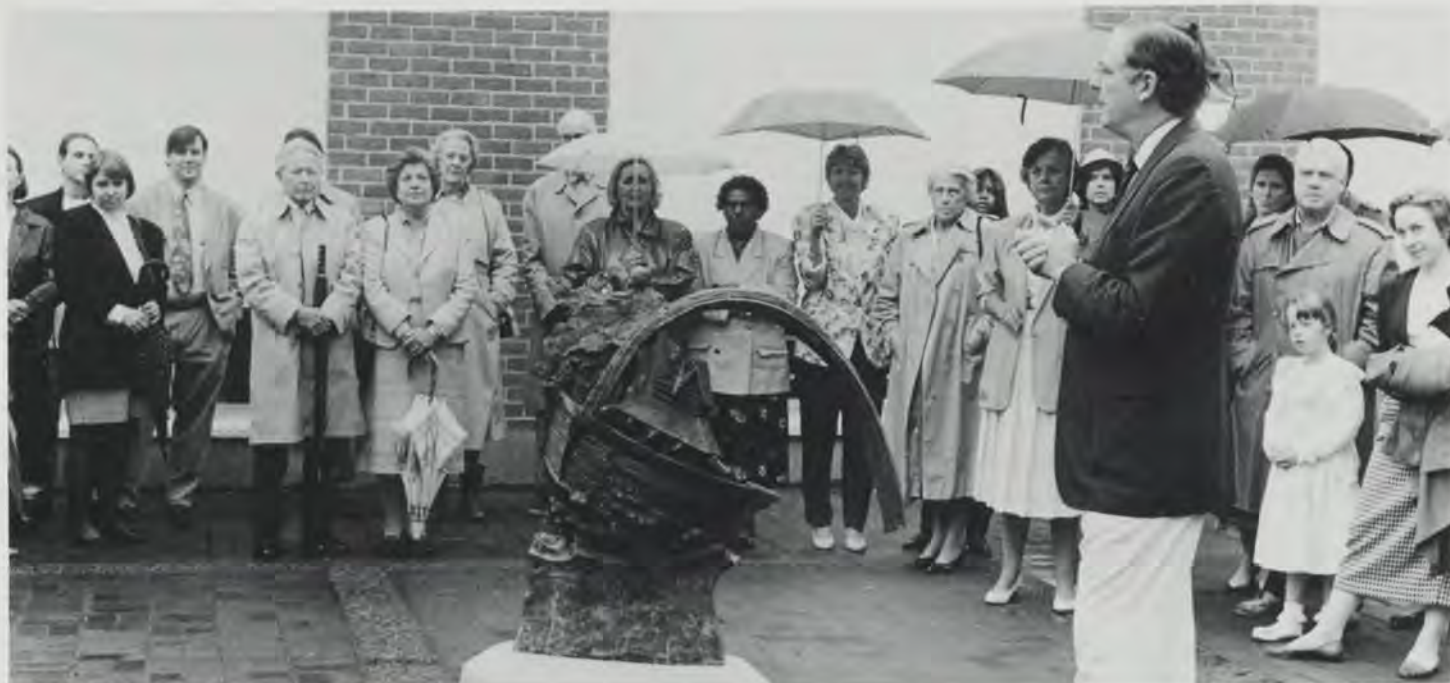
The dedication of "Noah's Ark."

the gift and thanked the alumni who made it possible.