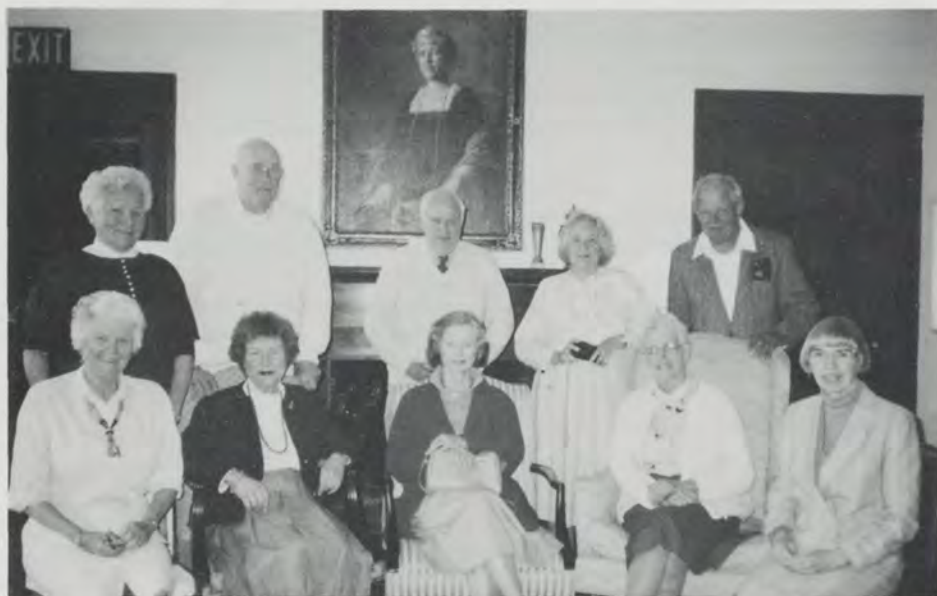
MFS Class of 1942 (with their husbands) celebrate their 50th reunion at Colross.